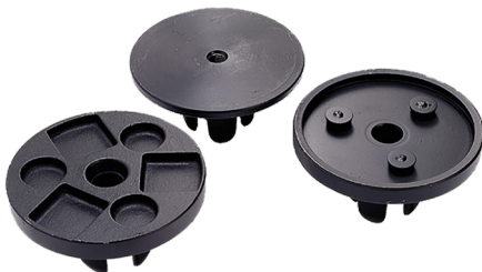
Base-plate to hold abrasive tools